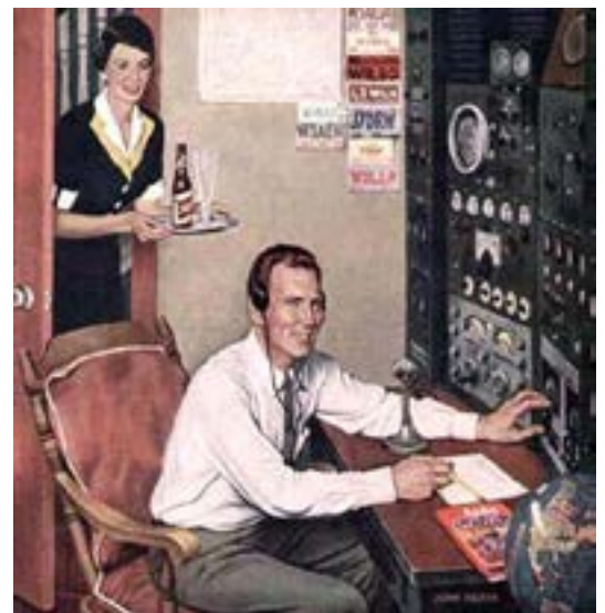
In the not-so-good old days when the wife would bring the husband a beer while he was on the radio! My, how things have changed!